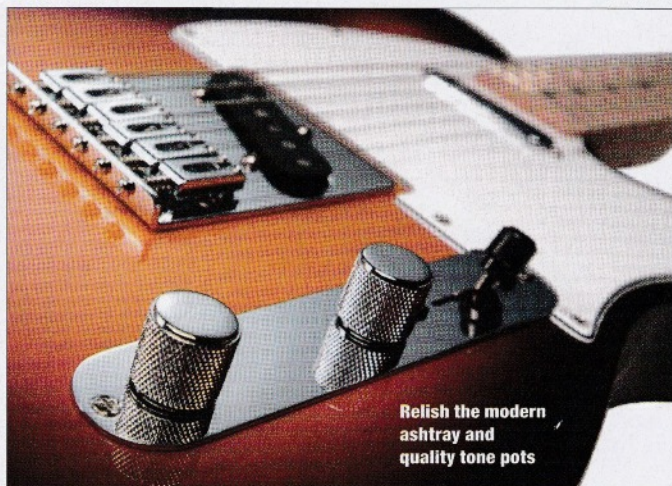
Relish the modern ashtray and quality tone pots

Beginner models have never been more electric