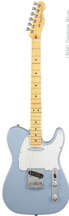
(304) Daphne Blue

The Highway One Telecaster guitar takes the term 'workhorse' to the nth Degree. Features include an alder body paired to a maple, modern "C"-shape neck with a rosewood or maple fingerboard, 22 jumbo frets, two Hot single-coil Tele® pickups with AINiCo 3 magnets, a Greasebucket tone circuit, and a satin nitrocellulose lacquer finish. Available in Three-color Sunburst (300), Daphne Blue (304), Black (306), Honey Blonde (367) and Wine Transparent (375).