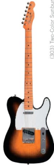
(303) Two-Color Sunburst